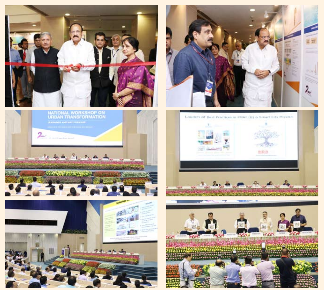
Glimpses of Two Years of PMAY(U) Celebration

CLSS Award ceremony was organised to acknowledge the efforts made by States, Banks and financial institutions with regard to the CLSS component of PMAY(U) Mission. The award ceremony was steered by National Housing Bank, being one of the CNAs of the Mission.