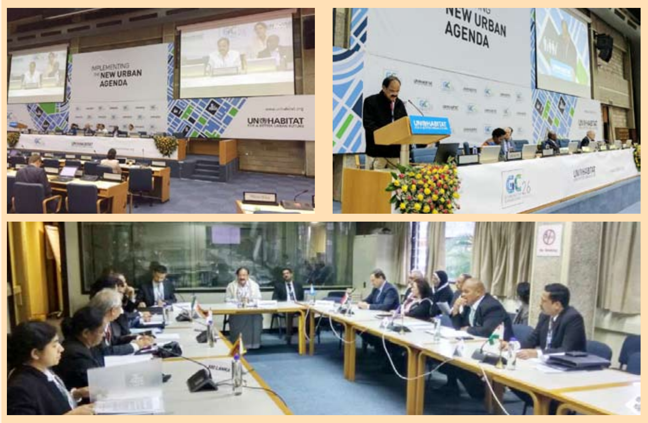
Glimpses of 26th Governing Council of UN-Habitat and Bureau Meeting of APMCHUD

The theme of the 26<sup>th</sup> Governing Council of UN-Habitat scheduled from 8<sup>th</sup> May to 12<sup>th</sup> May, 2017 in Nairobi, Kenya was "Opportunities for the effective implementation of the New Urban Agenda" including the Sub-themes: (i) Towards