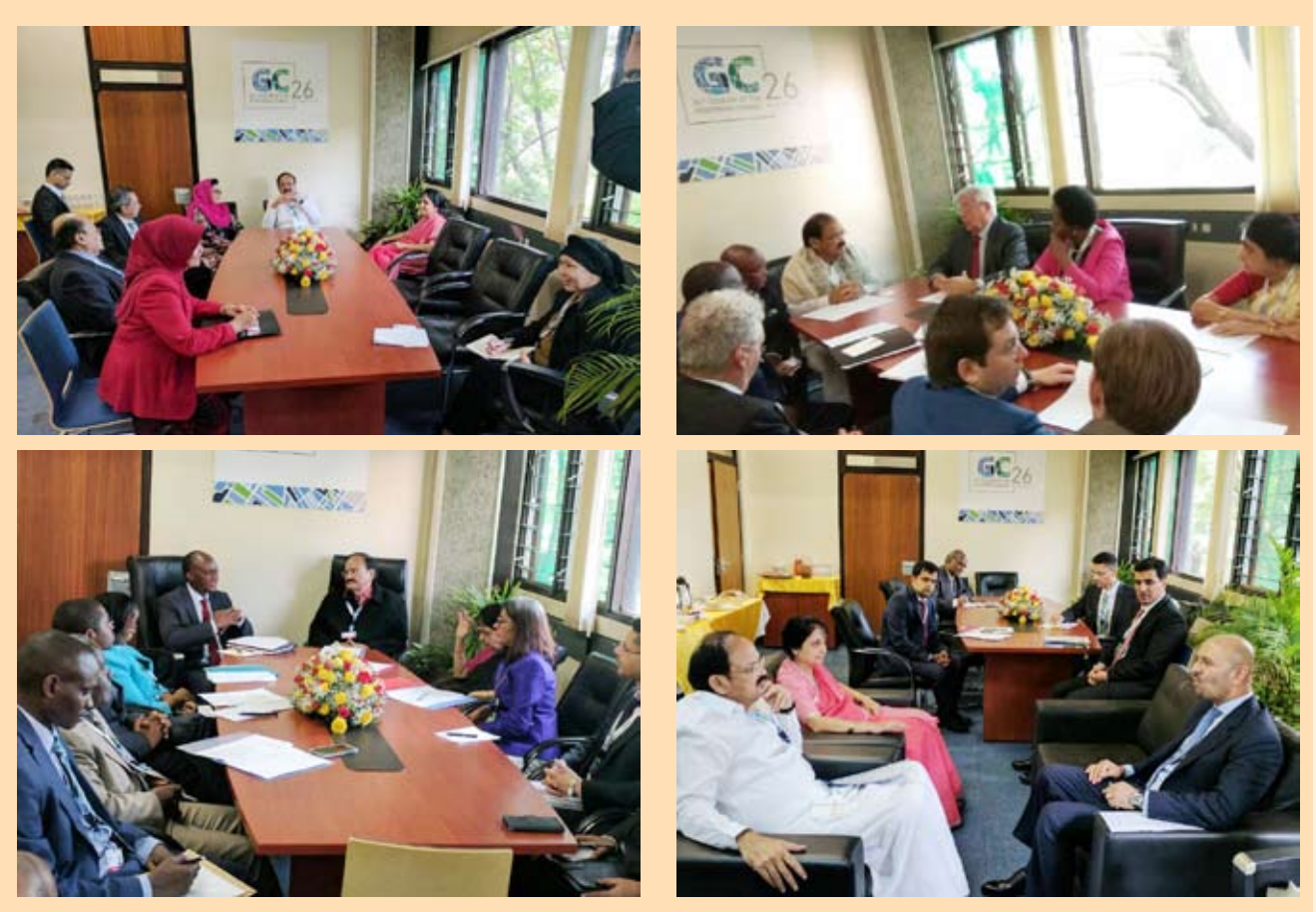
Glimpses of Meetings on the sidelines of 26th Governing Council of UN-Habitat

inclusive, sustainable and adequate housing for a better future; (ii) Synergies and financing for sustainable urbanization, and (iii) Integrated human settlements planning for sustainable urbanization.