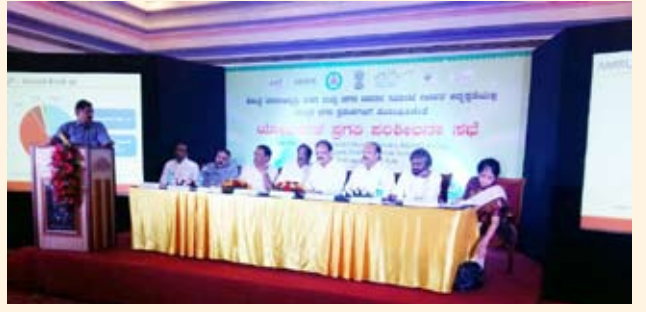
Karnataka review held in Bangaluru on 02 May 2017